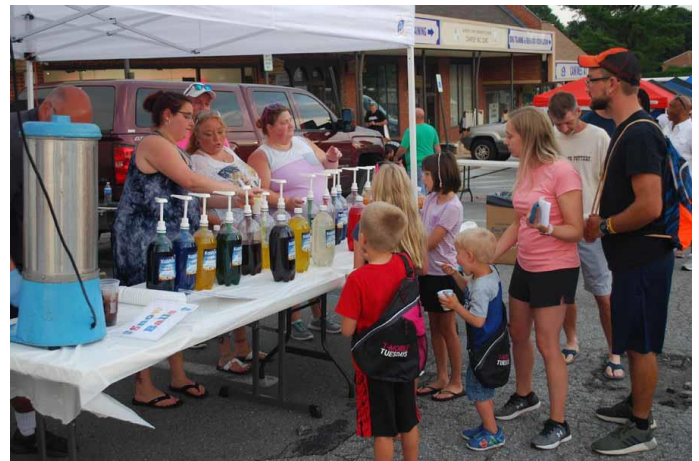
NNO 2019 – We will get there again.

Enthusiasm for National Night Out is beginning to build as plans for this summer's activity are discussed. Residents, businesses and community groups look forward to participating in an outdoor socially responsible event that is fun, and informative.